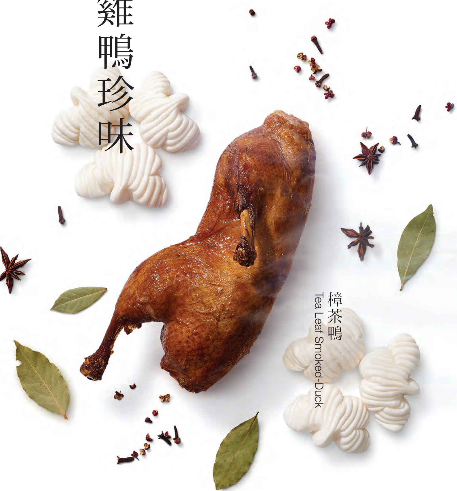
樟茶鴨 Tea Leaf Smoked-Duck