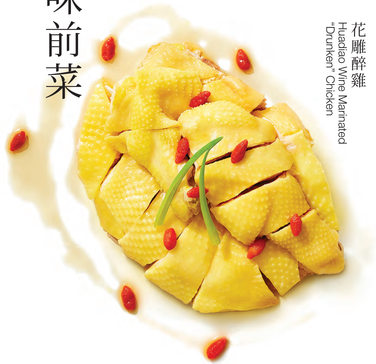
花雕醉雞 Huadiao Wine Marinated "Drunken" Chicken