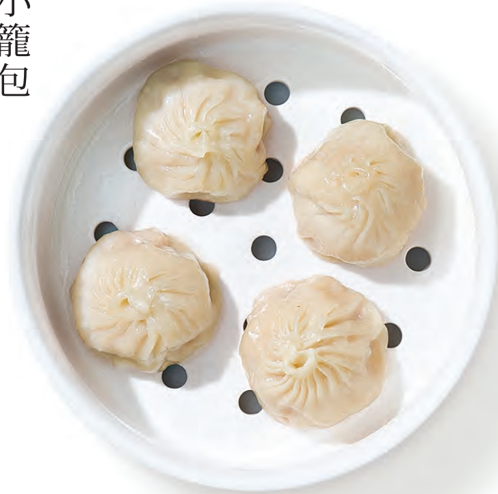
小籠包 Steamed Pork Dumplings