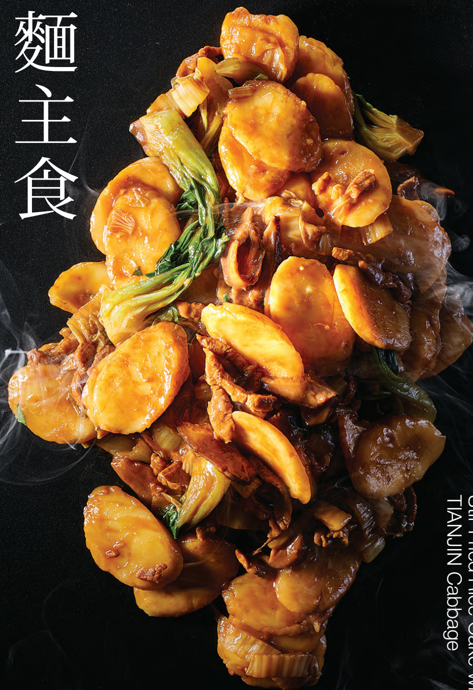
上海津白炒年糕 Stir-Fried Rice Cake with TIANJIN Cabbage