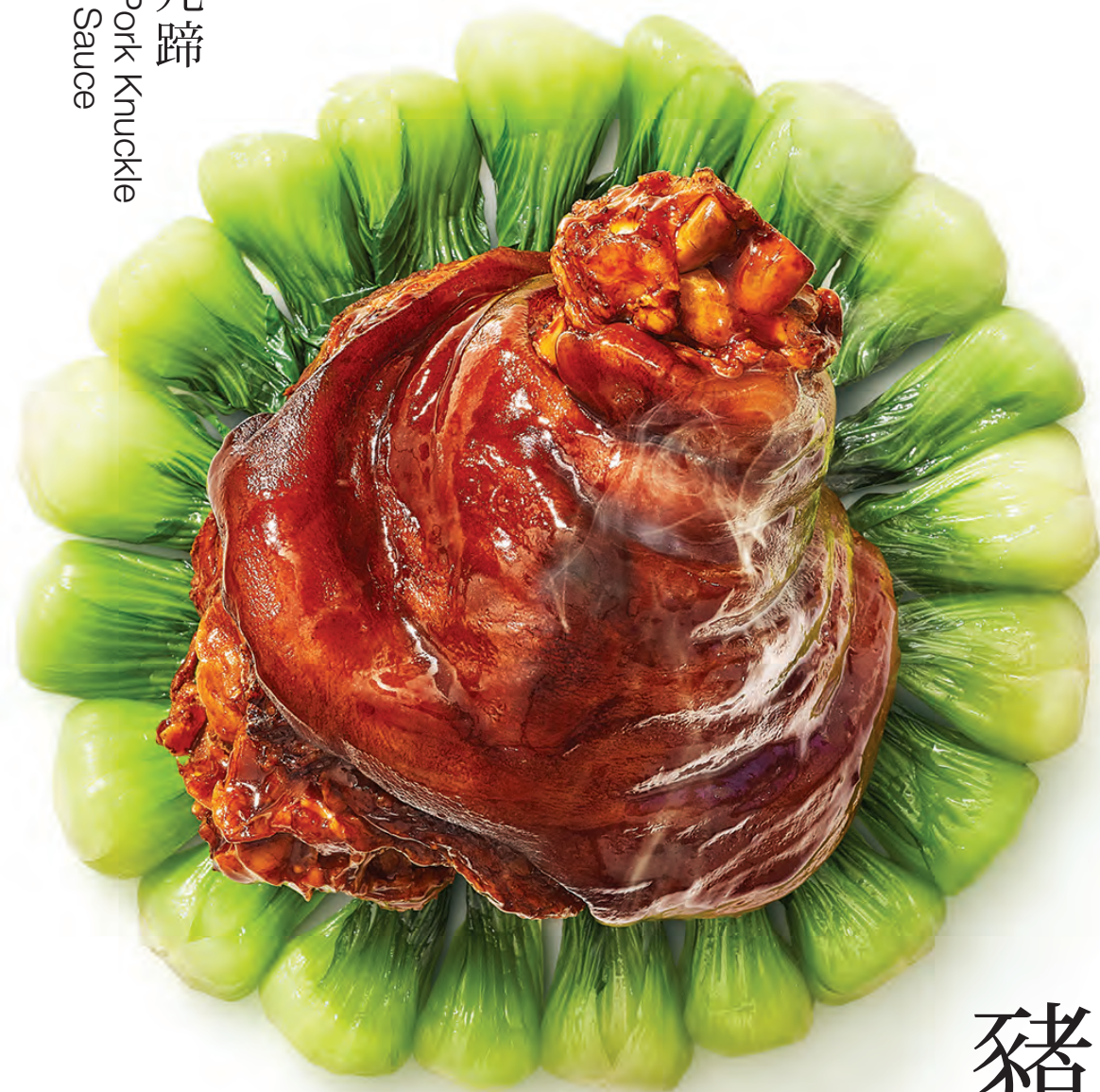
紅燒元蹄 Braised Pork Knuckle in Brown Sauce