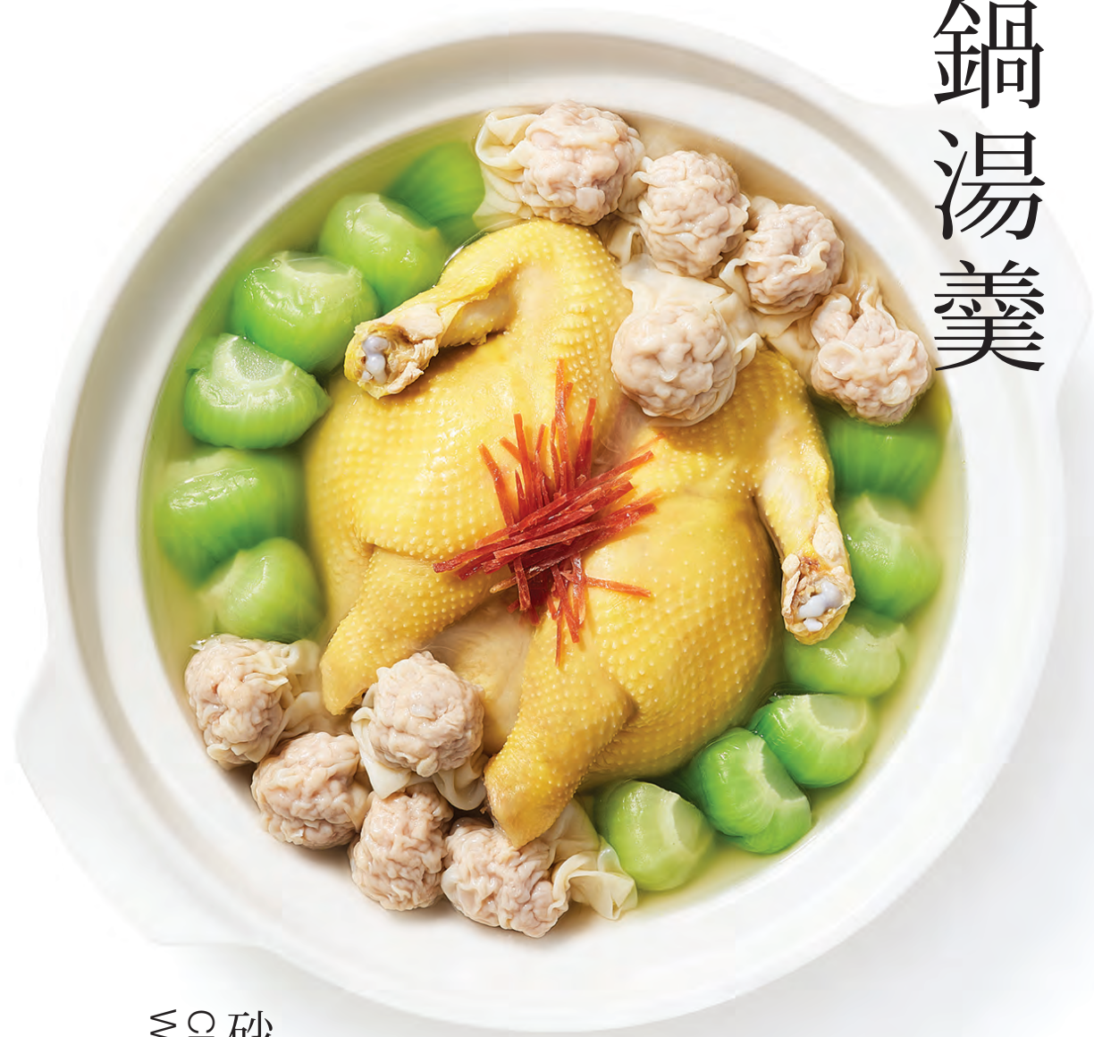
砂鍋雲吞雞 Chicken and Wonton Soup