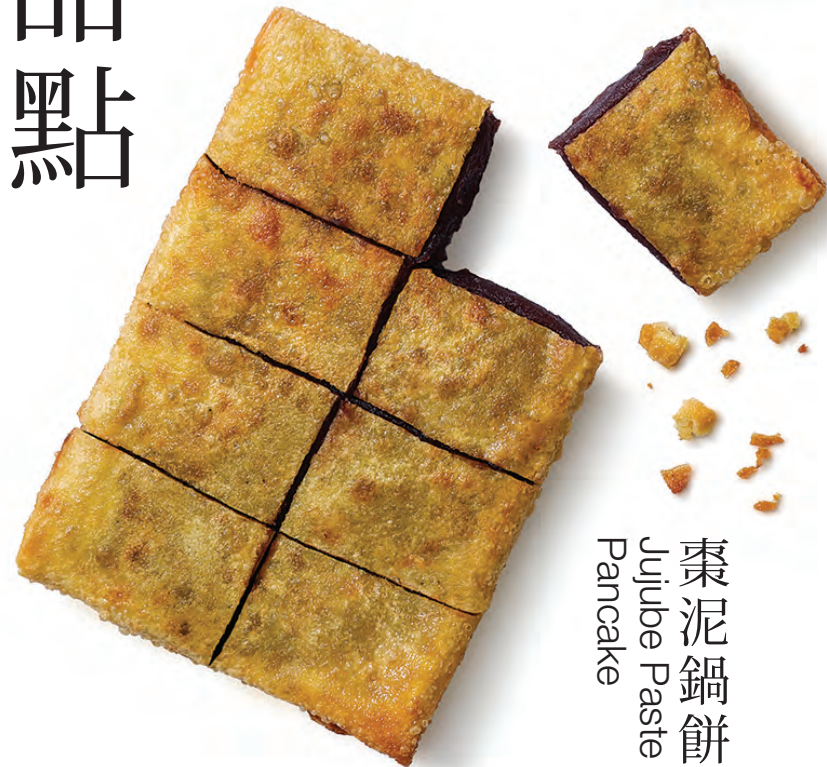
棗泥鍋餅 Jujube Paste Pancake